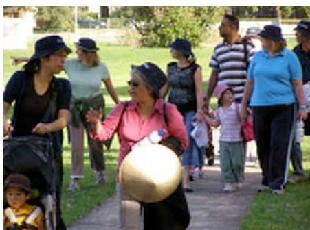
Parents, staff and children walking to Globe preschool on 'walk to Globe day'

Successful 'Walk to childcare days' were organised at Bronte Child Care Centre and Globe preschool. These were pre-arranged days where parents walked to childcare with their children, meeting up with other parents on the way. The Councils and centres actively supported these events, with advertising prior to the day.