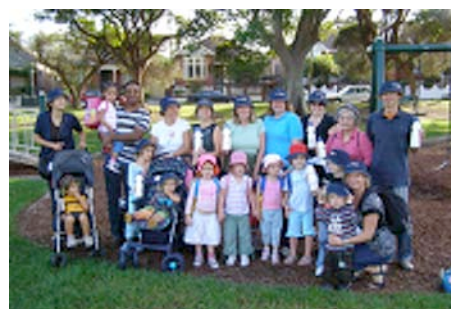
Globe parents, staff and children stop in a local park on their way to preschool.