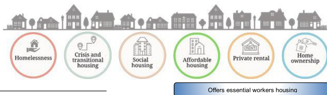
Diagram 1 Essential Worker Housing in the the Housing Continuum 4